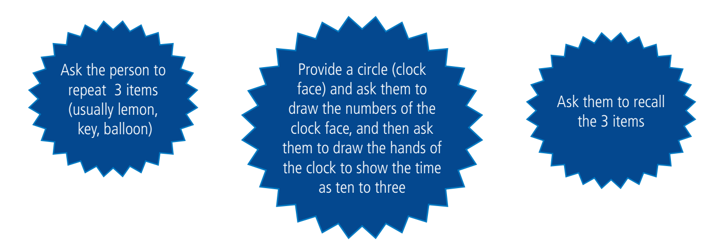
Fig 1: The Mini Cog Test for Screening for Dementia